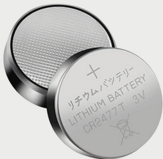
CR2477 CR COIN TYPE LITHIUM BATTERY

USE YOUR PHANTOM SENSOR GEN 1 WITH ONE OF THE MOST AFFORDABLE BATTERIES ON THE MARKET.