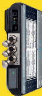
Recolector de Datos

WiSER 3X can easily and reliably connect to most 3rd party vibration and balancing instruments using the optional WiSER Universal Receiver.