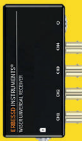
Receptor Universal Inalámbrico